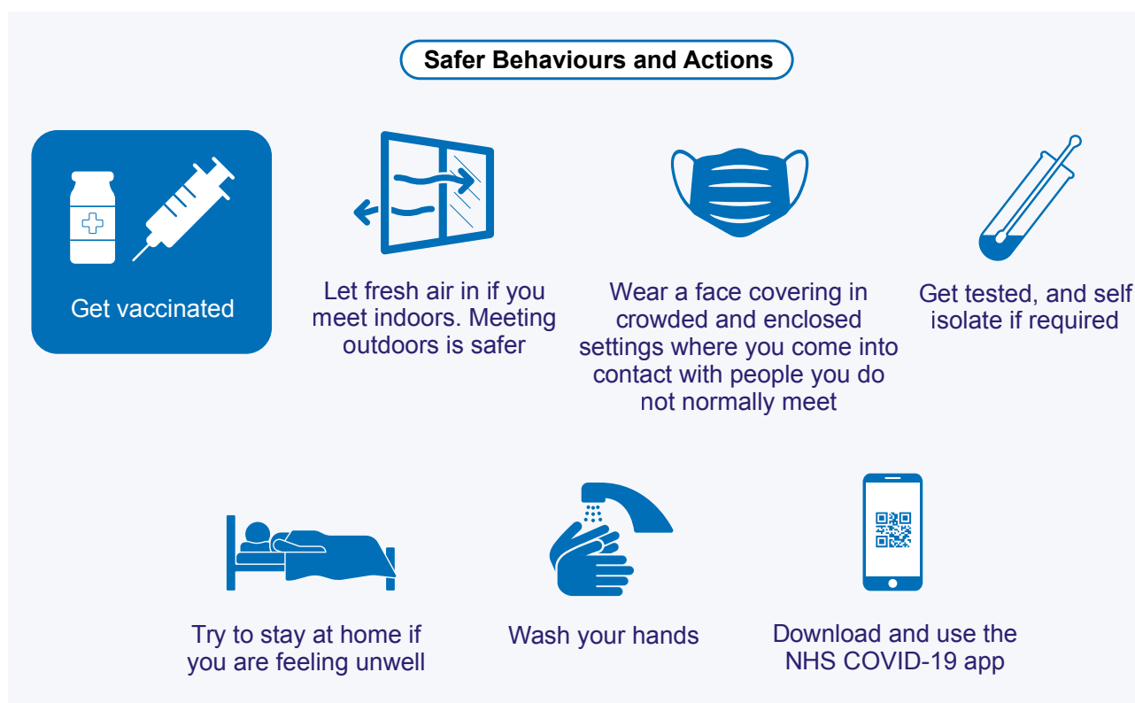
Figure 2: Safer Behaviours and Actions